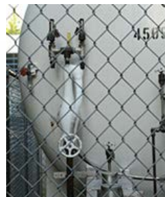
Many inspection sites are challenging for certain autofocus systems.

LaserSharp® Auto Focus, uses a built-in laser distance meter that calculates the distance to your designated target with pinpoint accuracy.